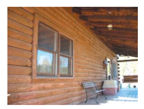
Protected area under porch.