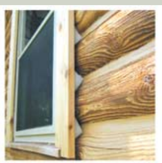
Insert foam blocks into void between logs and frame. Leave 3/8" gap between surface of foam and edge of frame.