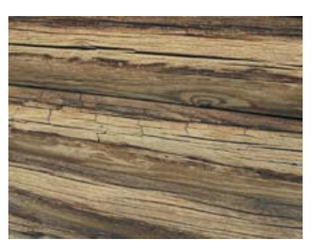
Wood decay found after the old finish was removed.

We will continue this article in our next newsletter outlining the methods and products used.