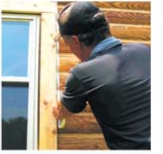
Apply masking tape to prevent sealant from smearing onto the adjacent logs.