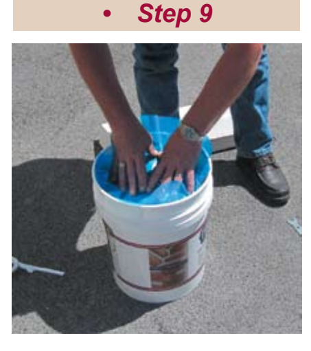
Replace the plastic liner over the surface of the sealant.