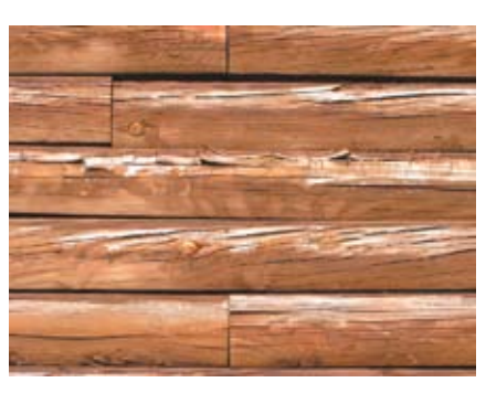
"Alligator Effect" due to weathering of unprotected surface.