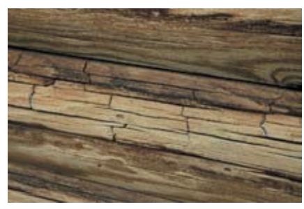
Close-up of weathering.

Checking and weathering of logs due to lack of maintenenace.