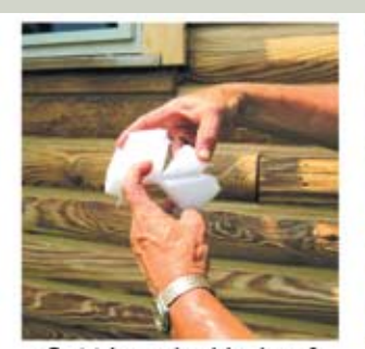
Cut triangular blocks of EPS or polyethylene foam.

Log homes and autumn leaves seem to go together. Enjoy the season and don't hesitate to give us a call if you have any questions about maintaining your log home.