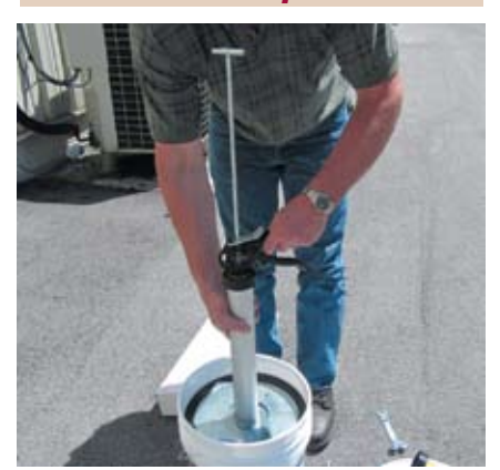
(Continued on page 4)