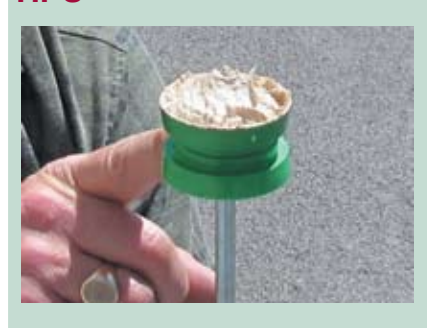
Make sure that the plungers are positioned correctly on the end of the rod.