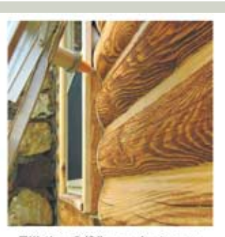
Fill the 3/8" gap between the surface of the foam and the edge of the frame with sealant.