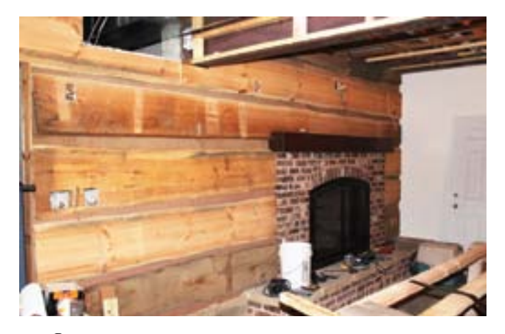
Basement in process

What's next for Judy and Stu? They are currently finishing their 1200 sq. ft. basement and consistent with their philosophy, much of the building materials are repurposed.