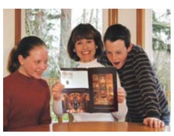
Order Perma-Chink Systems' Free Catalog

Join our E-Mail List to receive monthly newsletter with Technical Tips, Interesting Stories, Yummy Recipes and Monthly Specials. Log on to permachink.com to subscribe or e-mail us: news@permachink.com