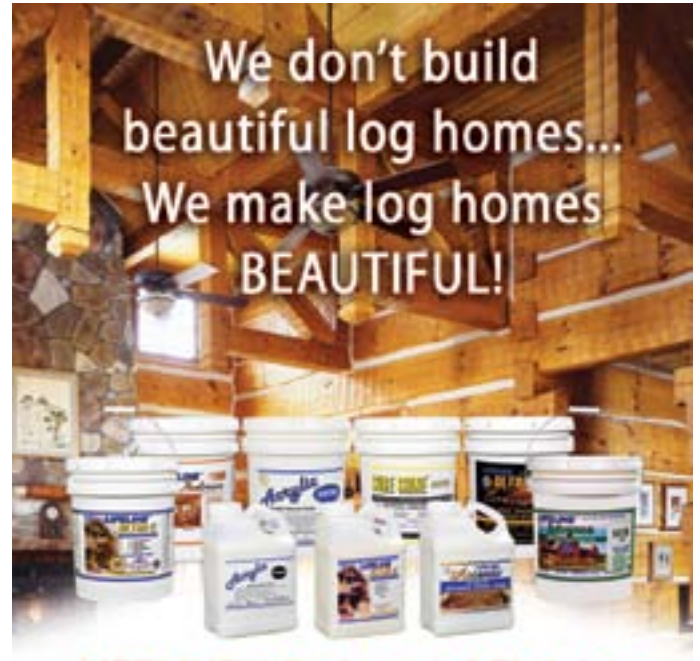
LIFELINE™ Stains and Finishes for your home.

When we first introduced our Lifeline Advance Gloss and Satin topcoats we were told that no home owner would want their log home to look like their dining room table. But what we discovered was that log home owners do want their homes to look as beautiful as their dining room table. And they want that beauty to last. That's why we have seen such incredible growth of our Lifeline Ultra finish system. So although we at Perma-Chink Systems built our reputation on performance, beautifying your home is our business.