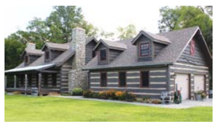
Exterior from driveway

To get that 200 year old "look", the logs selected were our Timberlake profile, 6" thick x 14" to 22" wide and tapered, with dovetail corners and chinking. Wavy edged White Pine siding was used on the dormers and gable ends to complement the log style. The home delivered in the spring of 2009 and Hearthstone's package included our log installation and dry-in service."