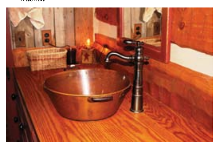
Jelly cooking pot sink